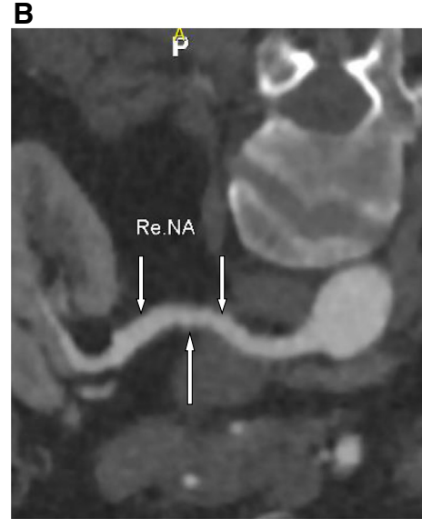
Fig. 1. Woman 53 years, known with premature hypertension and migraine in het teens/ twenties, presents with SCAD- distal LAD (panel A). CT scan of her renal arteries reveals signs of FMD (string-of-beads) in the right renal artery (panel B).

for P-SCAD therefore remains ill-defined. Despite a hypothetical mechanistic association with increased coronary sheer stress, delivery per se does not appear to be a prime driver of P-SCAD events [38]. The very high progesterone-levels during pregnancy and the rapid hormonal changes thereafter may be an important reason why SCADs occur more often during or shortly after pregnancy. Up to now there are no other data suggesting that P-SCAD patients are different from other SCAD patients. More research is needed on potential triggers for SCAD during pregnancy.